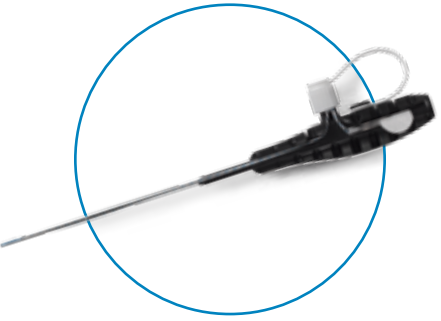
JuggerKnot Soft Anchor — 1.4 mm Short