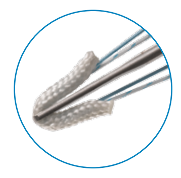
JuggerKnot Soft Anchor — 2.9 mm